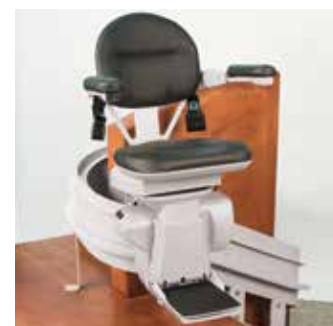
Mid-park and charge station for staircases with middle landings.