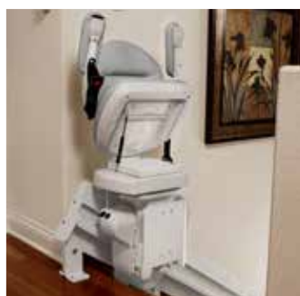
Power folding footrest flips up/down when seat is raised/lowered.