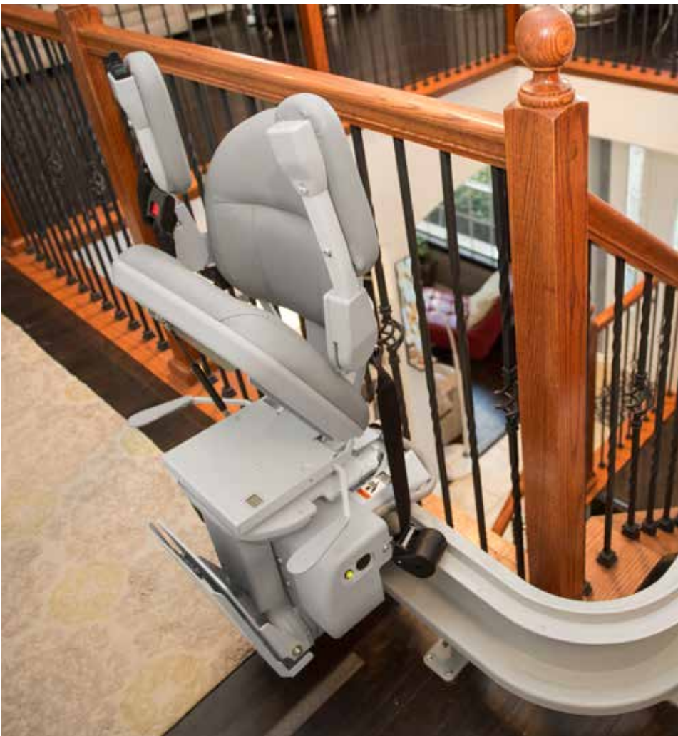
Custom made specifically for your home.