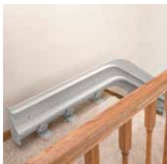
Top or bottom park position extends rail away from the staircase.