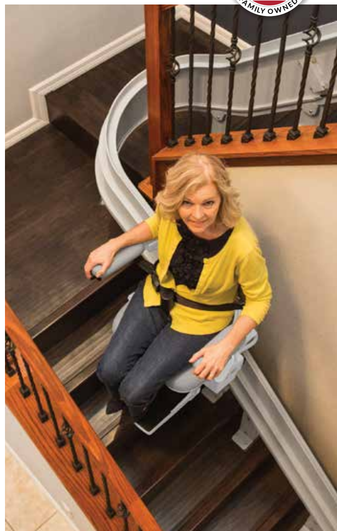
Crafted for a precision fit around curves.