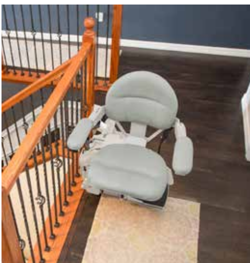
Offset swivel seat makes it easy to get on/off.