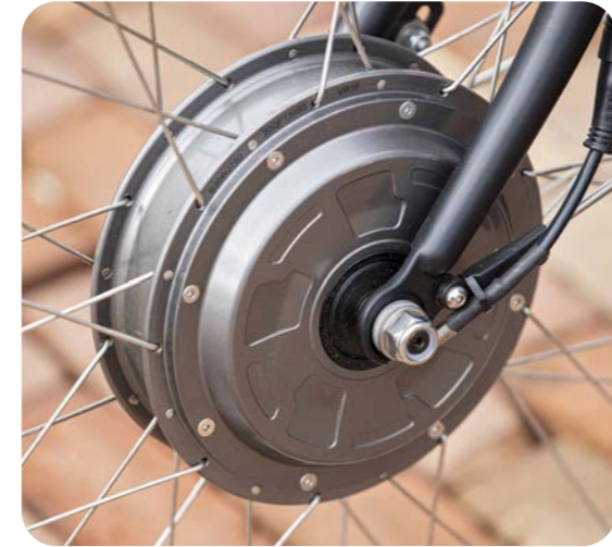
VR1F motor Silent electric system